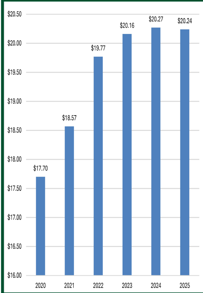
Office Market Rate PSF