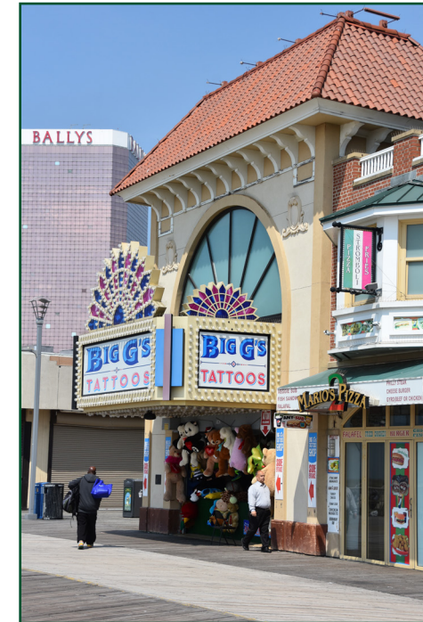
Atlantic City Boardwalk