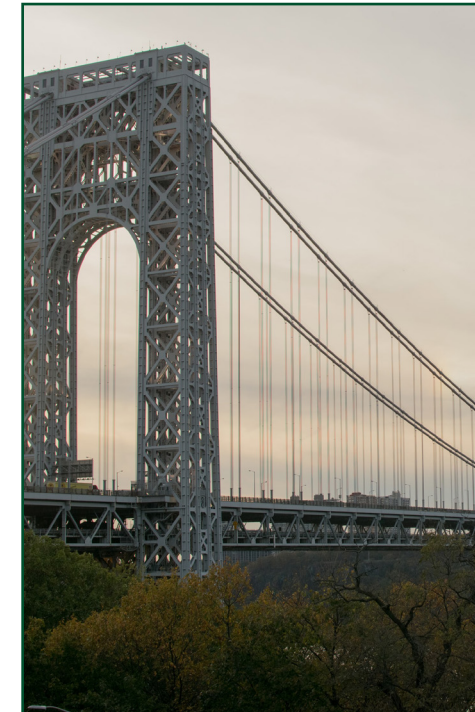
George Washington Bridge