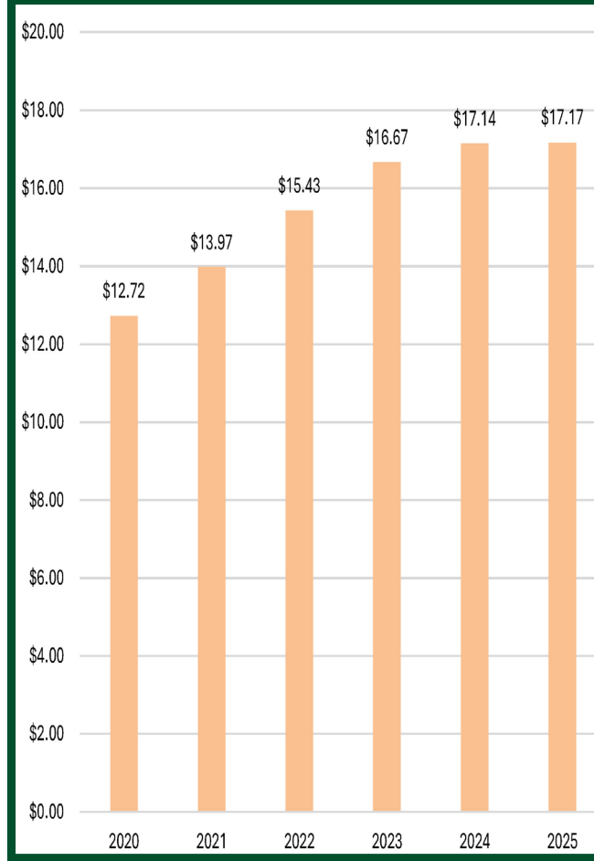
Industrial Market Rate PSF