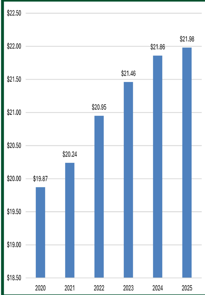
Office Market Rate PSF