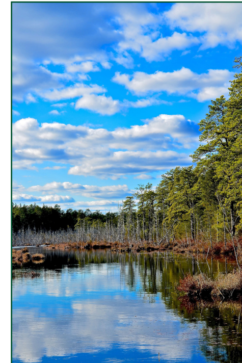
The Pine Barrens