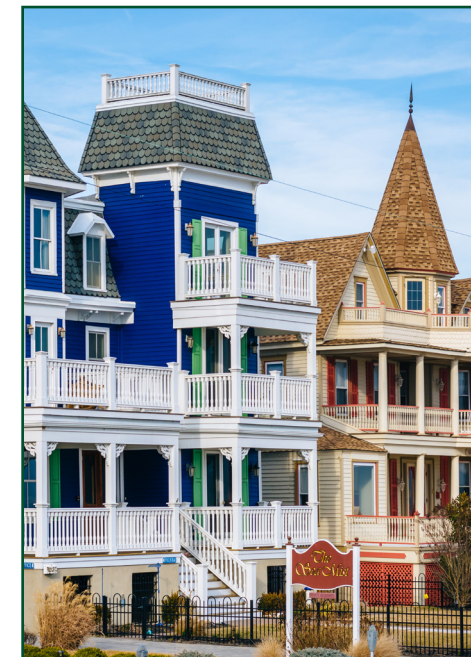
Victorian Homes in Cape May