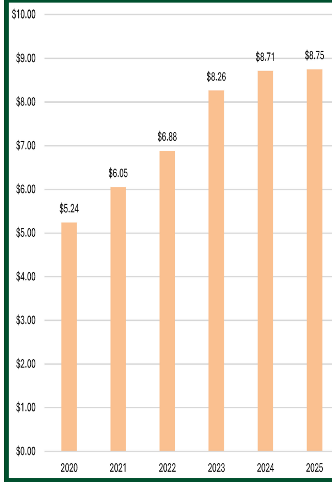
Industrial Market Rate PSF