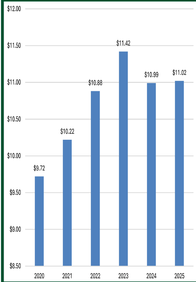
Office Market Rate PSF