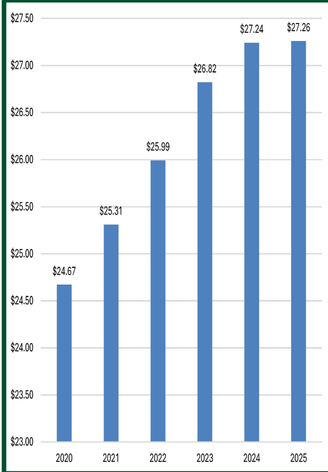
Office Market Rate PSF