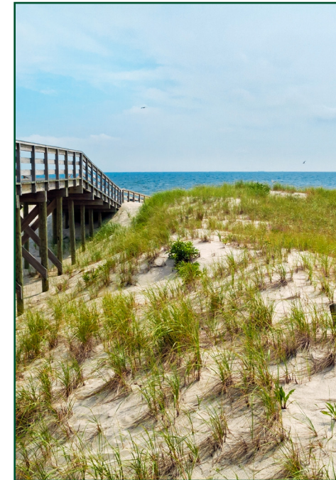
Island Beach State Park