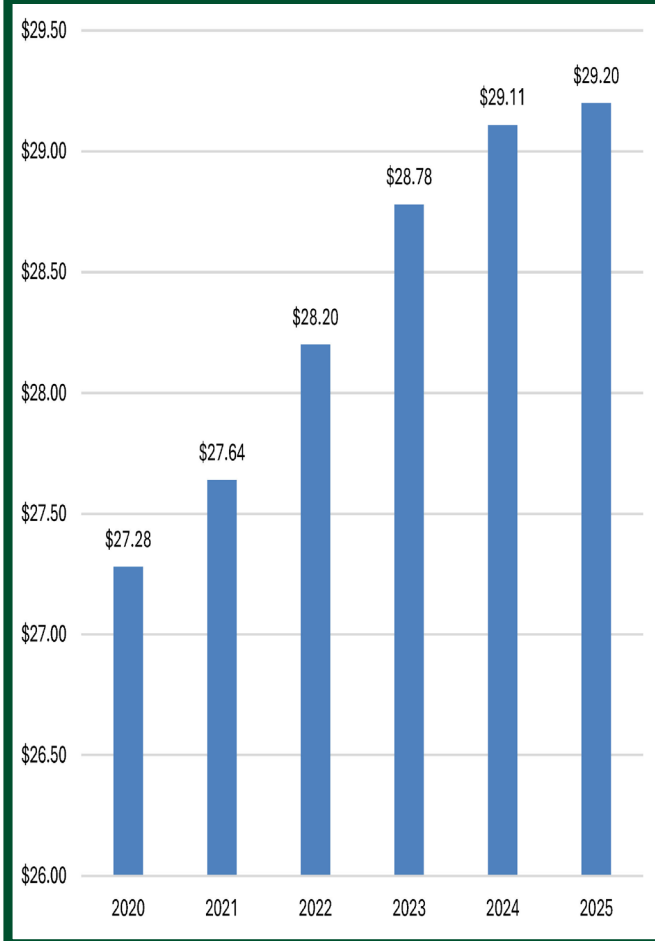
Office Market Rate PSF