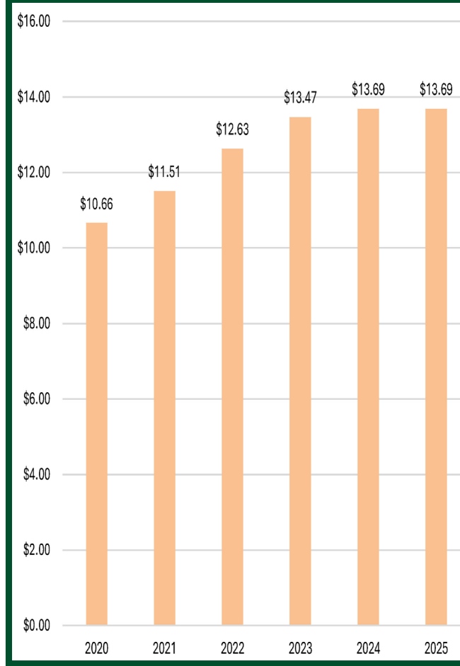
Industrial Market Rate PSF