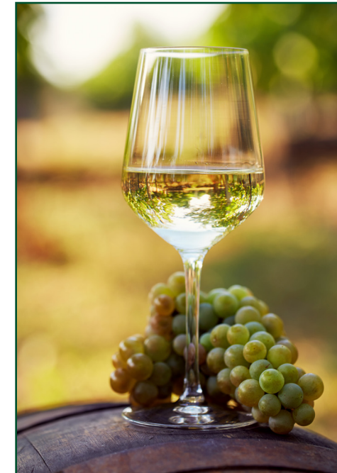
Auburn Road Vineyard & Winery