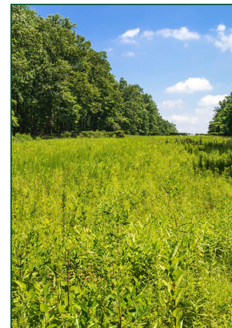
Sourland Mountain Preserve